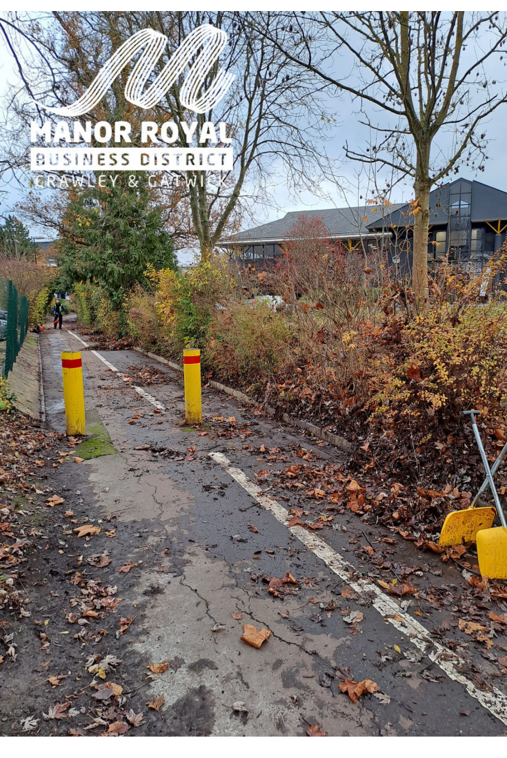
Location – Woolborough Lane Cycle Path.

Cycle/footpaths are cleared of leaves and detritus to allow for clear access.