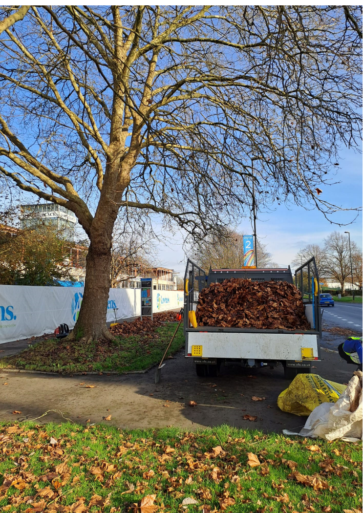
We do this as leaves will starve the grass of much needed light and air, which will prevent the grass from growing.

However, in some area's leaves will be left to support wildlife and soil health.